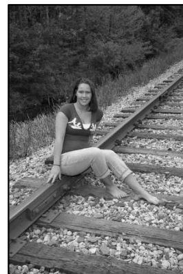
3 NO! too far away and difficult to crop