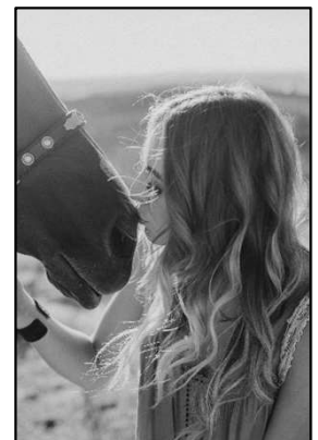
1 NO! has a prop, and you can't see her face

We will request a replacement photo if yours does not meet these guidelines, OR we will use your ASB card photo instead