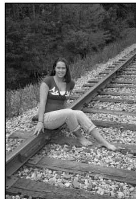
3 NO! too far away and difficult to crop