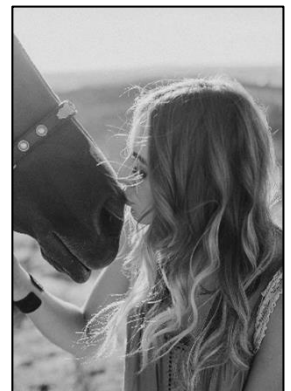
1 NO! has a prop, and you can't see her face

We will request a replacement photo if yours does not meet these guidelines, OR we will use your ASB card photo instead